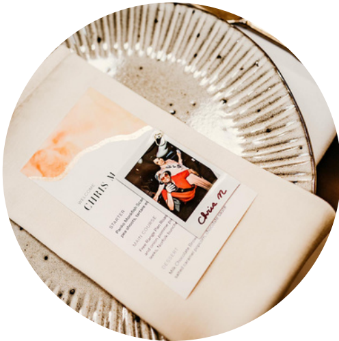
MENU - SELENE COLLECTION