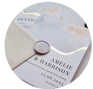
DIGITAL FOIL PRINTING

White ink printing can be completed by our trusted supplier using their inventory of card stocks. For specific enquiries we will need quantities and sizes before quoting you a price for this method.