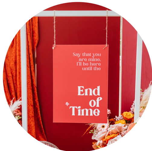
HANGING SIGNAGE BOUQUET & BELLS