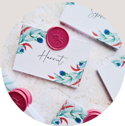
CUSTOM INITIAL WAX SEALS BRIDGET & HARRY