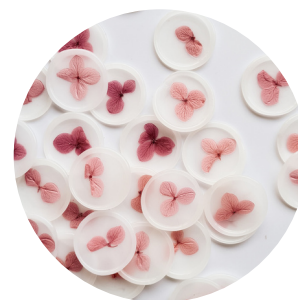
HYDRANGEA WAX SEALS