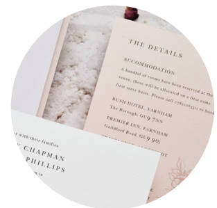
COLOURED CARD STOCKS

Our pre-designed collections come with selected envelopes but can be upgraded to a rainbow of other colours to suit your theme. We have access to the highest quality envelopes available in limited sizes.