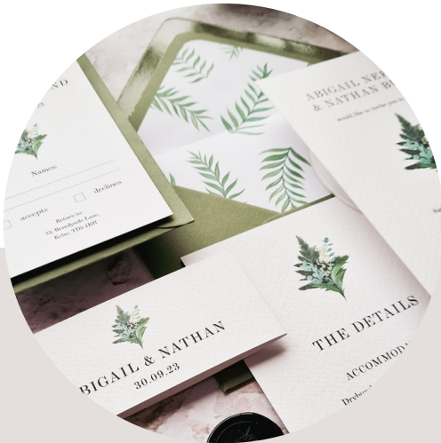
INVITATION PACKAGE - EVERLY COLLECTION