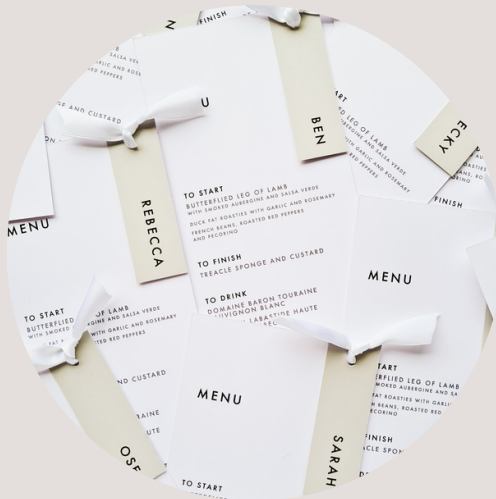
MENU - POMONA COLLECTION