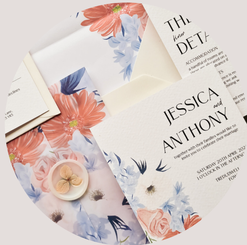
INVITATION PACKAGE - CLEMMY COLLECTION