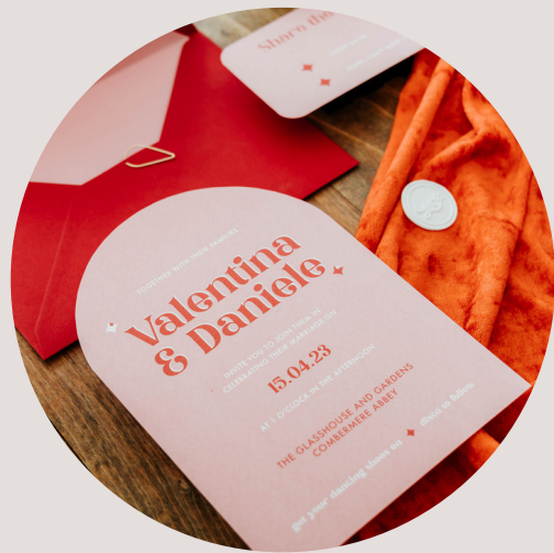
ARCH SHAPED INVITATIONS VALENTINA & DANIELE