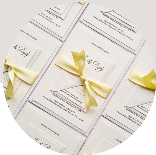
PERSONAL INVITATION STYLING TRACY & HOWARD