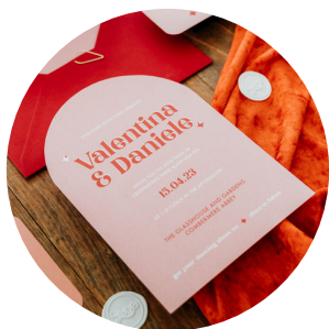
ARCH SHAPE INVITATIONS

Foil printing can be completed externally on select white card stocks. Quoted project by project and quantities are needed before a formal quote.