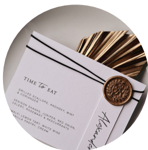
CORD / TWINE