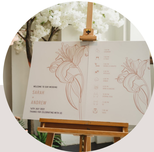
SIGNAGE - JUNO COLLECTION