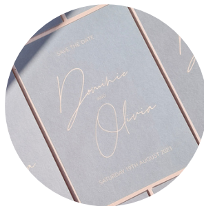
WHITE INK PRINTING

Most stationery can be printed double sided using digital printing methods. Please discuss items and sizes before ordering or making a deposit.