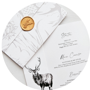
DOUBLE SIDED PRINTING

All our stationery can be upgraded if you have a specific idea in mind. In our studio we print digitally in black & colour ink on our chosen selection of white card stocks, but our trusted suppliers can do more for you with our designs. We offer a variety of print upgrades and card stock changes which will incur an extra cost on a project by project basis. If any of the following upgrades appeal to you please mention them in your enquiry form so we can advise you of the best way to achieve your desired outcome.