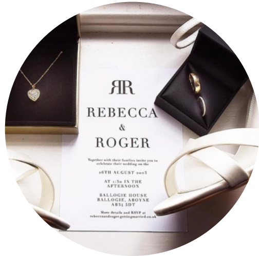
INVITATION - CERES COLLECTION